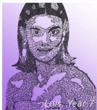
- Lots, Year 7