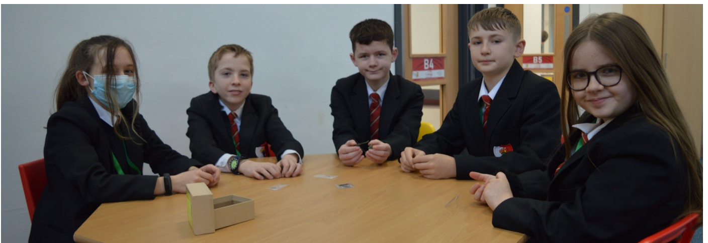
Students in The Bridge enjoyed investigating ancient artefacts