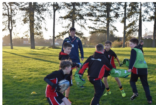
A new extra curricular opportunity for Year 7 and 8 launched this week, with students enjoying a rugby training session led by a Leicester Tigers coach.