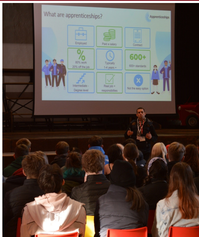
Year 12 had the opportunity to learn more about higher and degree level apprenticeships this week thanks to an informative PDP session

To give themselves the best chance of gaining a place on a competitive apprenticeship, students were advised to research the opportunities available thoroughly and to prepare to be the best they can be in every situation.