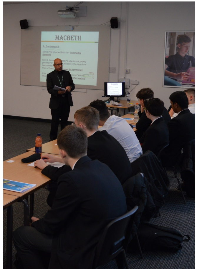
A conference this week to look at mindset and techniques for exam success, was just one of the tailored support tools utilised recently to help Year 11 succeed in their exams.

For additional support with revision or exam preparation, Year 11 students should speak to their Subject Leaders and Pastoral Team.