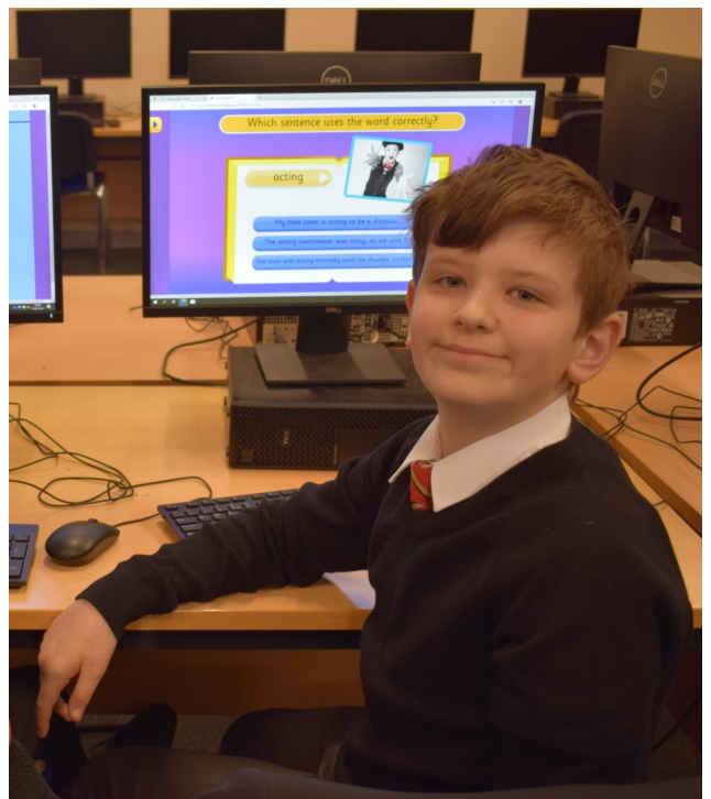
Year 8 students take part in fun online reading quizzes in the Library to support their literacy development.