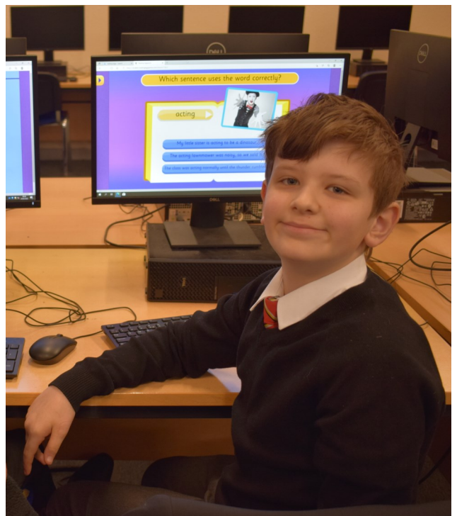
Year 8 students take part in fun online reading quizzes in the Library to support their literacy development.