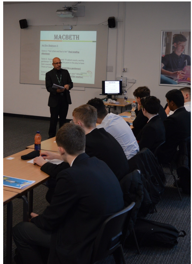
A conference this week to look at mindset and techniques for exam success, was just one of the tailored support tools utilised recently to help Year 11 succeed in their exams.

For additional support with revision or exam preparation, Year 11 students should speak to their Subject Leaders and Pastoral Team.