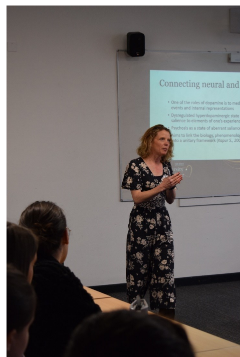
Students at JC6 were joined by visiting guest lecturers from Lincoln University this week.