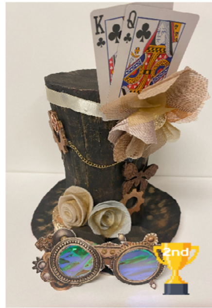
Steampunk Hat 6

Shading pencil, collage, coffee, 29cm, 21cm